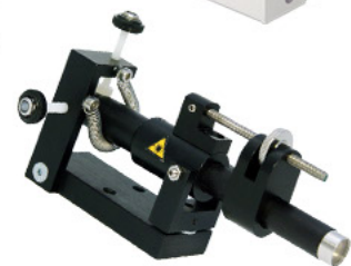
Spotlight Targeting System