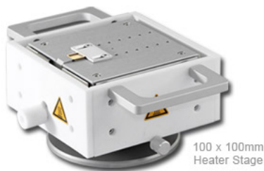
100 x 100mm Heater Stage