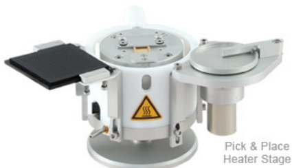
Pick & Place Heater Stage