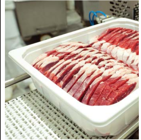
Dash-gatec-MAP Check 3 Vacuum-EN-1