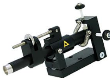
H50 Spotlight Targeting System