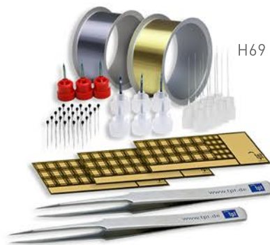
H69 Bond Starter Kit