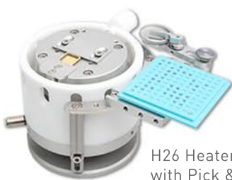
H26 Heater Stage with Pick & Place