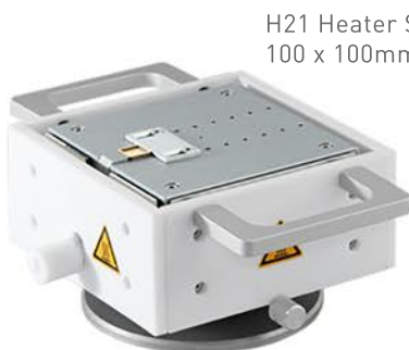
H21 Heater Stage 100 x 100mm