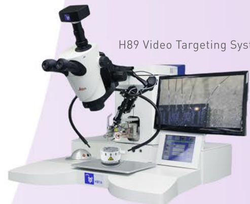
H89 Video Targeting System