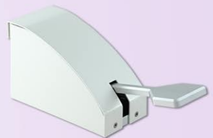
H51 Manual Z-Axis Control