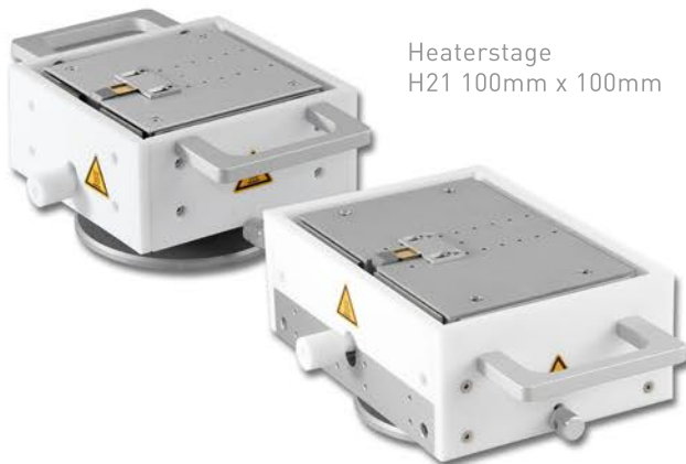
Heaterstage H21 100mm x 100mm